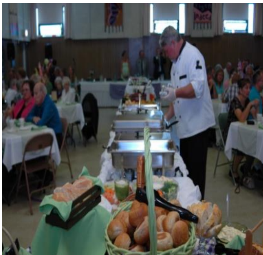
Wedding feast at Asbury Church

The fires in Los Angeles, California, are a blunt reminder of the damage we've done to our planet over the past century. Our planet recorded the warmest year in history in 2024, and Southern California's drought that began several months ago continued into the rainy season, setting them up for disaster.