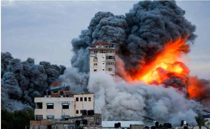
A high-rise tower hit by Israeli forces in Gaza City, October 2023

War in the Middle East is sadly becoming a cliché. But the horror suffered by victims when brutally attacked this past Saturday is not just another senseless attempt at harassing Israel. Hundreds died during a coordinated attack by a political group known as Hamas . Page 3