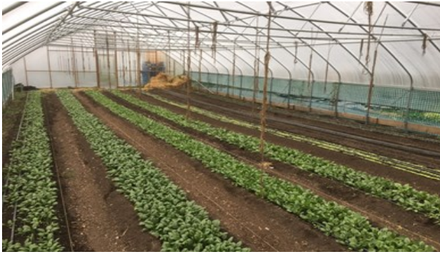
Feedflint hoop house ready for harvest...

The Season of Lent is a special time of year for the church. The diversity of ways in which churches around the world experience this season offers insight into the different ways that people experience the holy. For many, Lent represents a time of struggle illustrated by giving up favorite foods after celebrating Fat Tuesday with their favorite Paczki or other treats.