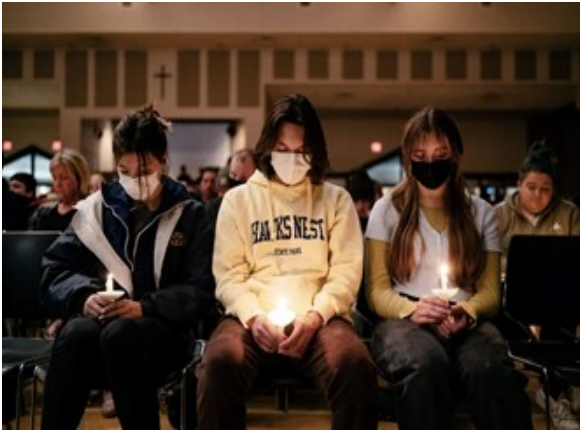
Oxford High School students gathered for a candlelight vigil...

Tuesday, November 30, was supposed to be an ordinary day for the 1,600 students attending Oxford High School. The vast majority of them got up the same time they ordinarily got up — got dressed following the same routine they ordinarily followed — and went to school along the route they ordinarily used to get to school.