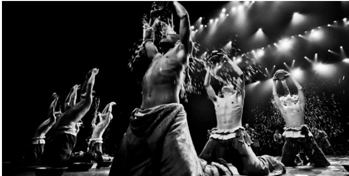
OzAsia Festival kicked off in reflective-then-dramatic style with Red Sorghum , an epic

Is it possible to live fearlessly when surrounded by uncertainty? Do old age, sickness, and death have to threaten us? It is said that only the good die young, but when the young die it is seen as an awful tragedy.