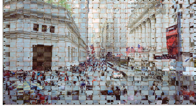
Wall Street, Seung Hoon Park Susan Spiritus Gallery 2

set aside our customary language. Instead of "Lent," we choose Easter preparations or some other phrase using more familiar words. Words that are more secular because they have multiple meanings in everyday use.