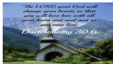
Prayer is at the heart of our beliefs

There will be a water distribution on Friday, March 22nd in the Asbury parking lot from 3:00-7:00pm...We will still have our water distribution on Tuesday March 19th , from 10am-2pm, as usual.