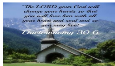
Prayer is at the heart of our beliefs