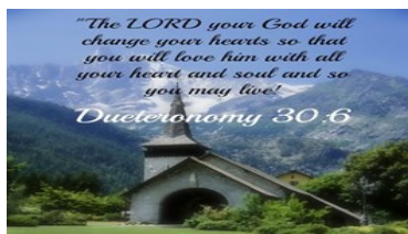
Prayer is at the heart of our beliefs