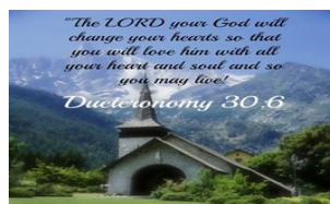
Prayer is at the heart of our beliefs