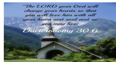
Prayer is at the heart of our beliefs