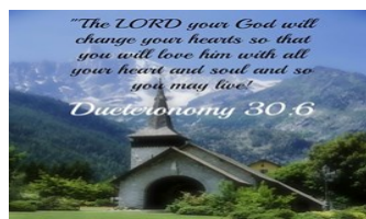
Prayer is at the heart of our beliefs