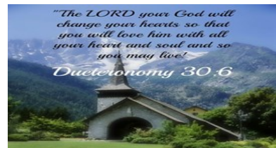
Prayer is at the heart of our beliefs