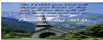
Prayer is at the heart of our beliefs