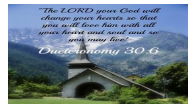
Prayer is at the heart of our beliefs