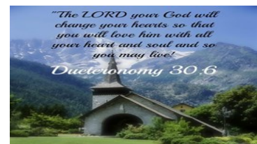
Prayer is at the heart of our beliefs