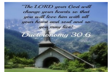
Prayer is at the heart of our beliefs