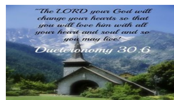
Prayer is at the heart of our beliefs