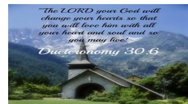
Prayer is at the heart of our beliefs