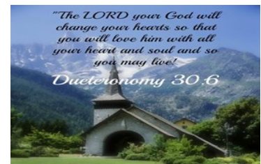
Prayer is at the heart of our beliefs