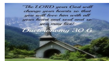
Prayer is at the heart of our beliefs