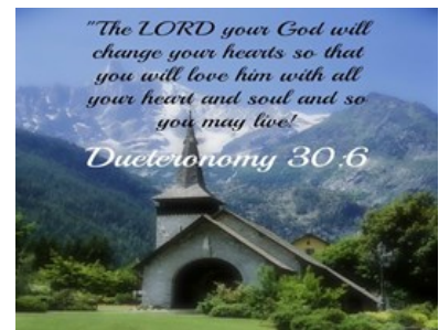
Prayer is at the heart of our beliefs

Pastor’s Book Club meets each Tuesday at 12Noon for fellowship, food and learning.