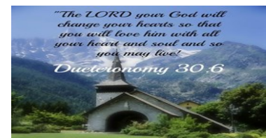
Prayer is at the heart of our beliefs