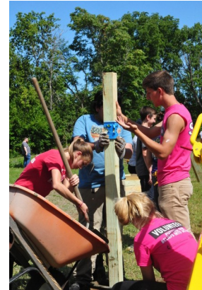
Birmingham 1st Youth Installing a Fence Post on Jane Ave

having already conquered all of our struggles. We're sinners who are seeking healing, and that's okay. There's no need to put on a perfect face or to hide our struggles. The key to Christian Community is accountability, having people who know your struggles and care enough to help you to conquer them. There is no judgement here for failures, just support to try again and succeed.