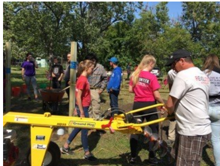
Installing posts for the new fence

The students of Central Michigan University are making their third trip on Saturday, September 30. Asbury will be sharing this group of around 150 students with the University of Michigan Touch-a-Truck event