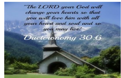
Prayer is at the heart of our beliefs