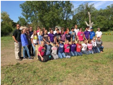
Birmingham 1 st UMC Youth

A shout out to the youth of Birmingham 1st UMC who joined volunteers from Asbury and our community on Saturday, September 2 to work on the new location for the Asbury Farm on Jane Avenue. The youth brought materials, adult supervisor with experience and know-how, creative gifts and loads of energy.