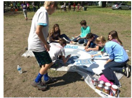
Painting an Original Graphic for the New Fence at the Jane Avenue Farm

The Asbury Farm is our long term response to the Flint Water Crisis. Healthcare professionals recommend nutrition as a