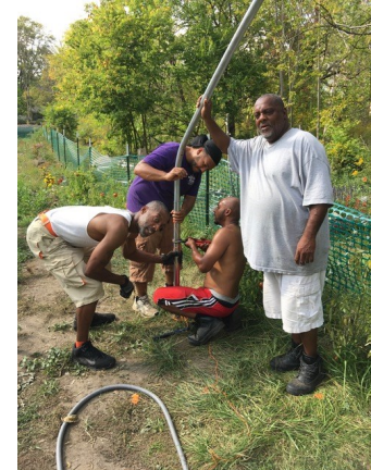
Hoop House Construction at Izzy's

"You are the light of the world. A town built on a hill cannot be hidden. Neither do people light a lamp and put it under a bowl. Instead they put it on its stand, and it gives light to everyone in the house."