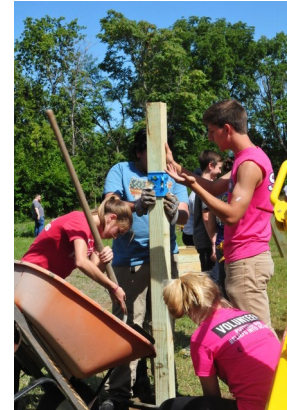
Birmingham 1st Youth Installing a Fence Post on Jane Ave

having already conquered all of our struggles. We're sinners who are seeking healing, and that's okay. There's no need to put on a perfect face or to hide our struggles. The key to Christian Community is accountability, having people who know your struggles and care enough to help you to conquer them. There is no judgement here for failures, just support to try again and succeed.