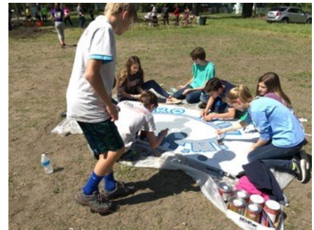
Painting an Original Graphic for the New Fence at the Jane Avenue Farm

The Asbury Farm is our long term response to the Flint Water Crisis. Healthcare professionals recommend nutrition as a