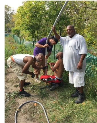
Hoop House Construction at Izzy's

"You are the light of the world. A town built on a hill cannot be hidden. Neither do people light a lamp and put it under a bowl. Instead they put it on its stand, and it gives light to everyone in the house."