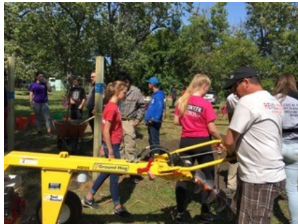
Installing posts for the new fence

The students of Central Michigan University are making their third trip on Saturday, September 30. Asbury will be sharing this group of around 150 students with the University of Michigan Touch-a-Truck event