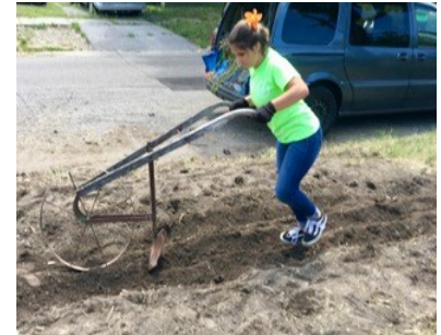
A youth volunteer from California plowing a row at our Jane Ave site

"You are the light of the world. A town built on a hill cannot be hidden. Neither do people light a lamp and put it under a bowl. Instead they put it on its stand, and it gives light to everyone in the house."