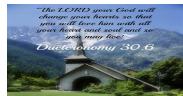
Prayer is at the heart of our beliefs