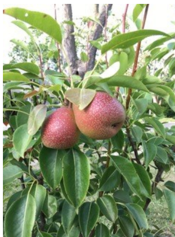
Pears ripening at the Asbury Farm

The choice for discipleship confronts us as a decision to push forward into the unknown from a worldly perspective. Jesus spent a lot of His teaching time emphasizing that the Kingdom of God is not like the world we know. In Pilate's interrogation of Jesus we read that "My Kingdom is not of this world" (John 18:36). If Jesus' Kingdom is not of this world then what world is His king-