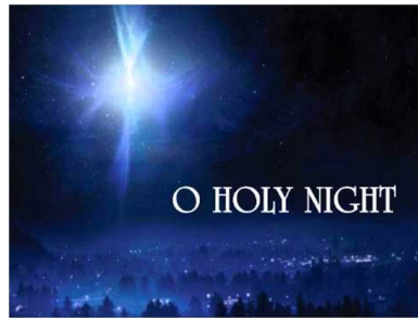
The Night Everything Changed

Every year I look forward to Christmas Eve worship with great anticipation. I plan for the service to be special, full of music and thought-provoking scenes. My hope is that all who attend will leave a little more in the true spirit of Christmas than when they arrived. A lot has happened this last year. The water crisis is the most notable. We built a hoop house this year, planted orchards and hosted a Christmas concert, a District Christmas party and 150 college students. We also gave away thousands of cases of bottled water and boxes of food. Yes, a lot has happened this year.