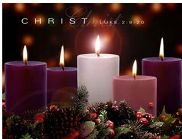
One Candle for Each of the Four Sundays before Christmas & a Christ Candle